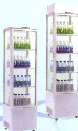
RT-235 L / 280 L